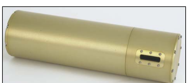
Profiler body with a specific head